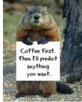
Ground Hog Day, February 2

Tuesday, February 25 7:00 p.m. Pops Concert - Onawa